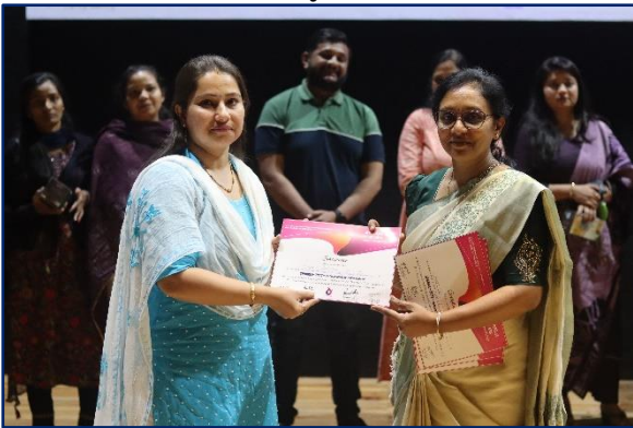
Falcitation by Directors to the Teachers