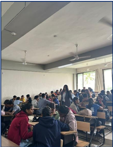
Ludo King Event