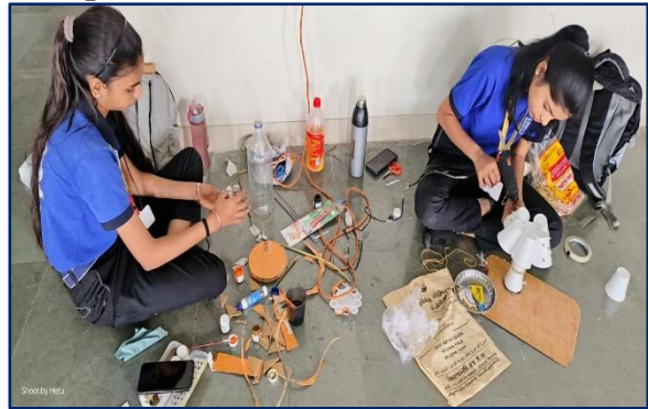
Best out of West