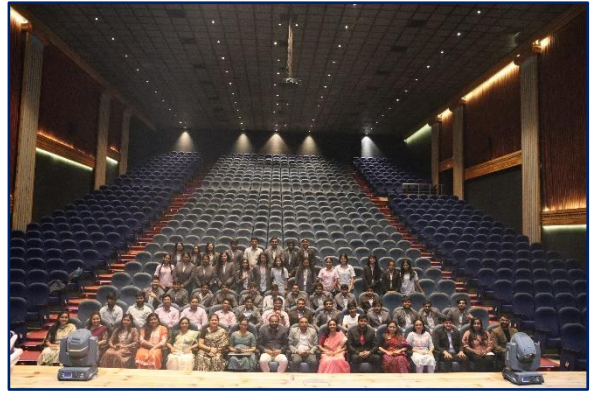
Staff and Students