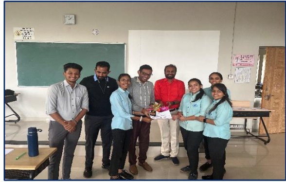
Ad Making Competition