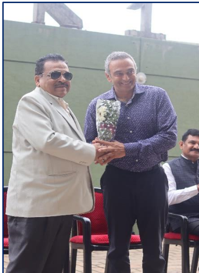
Falcitation to Guest