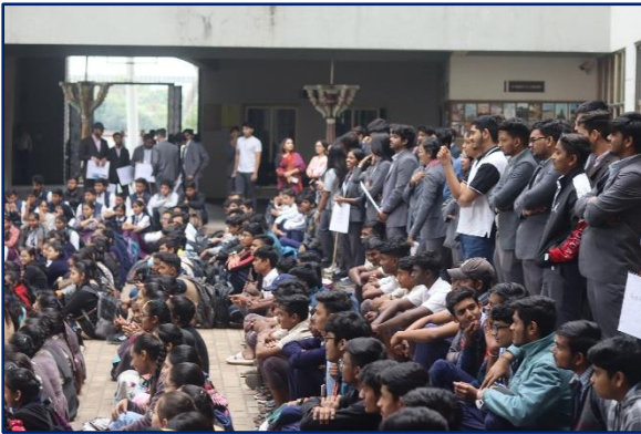
Students at March Past