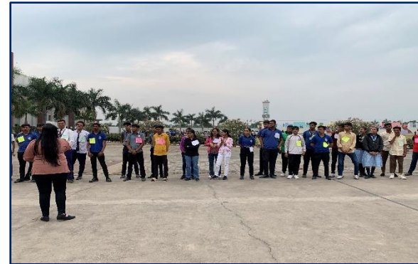
Tresure Hunt Event