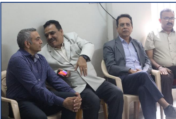
Interaction with Dignitaries