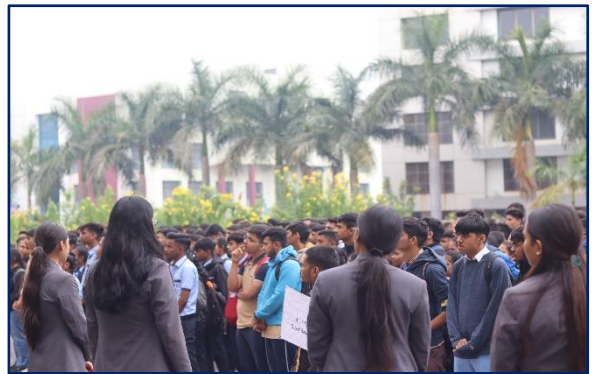
Students Ready to Compete