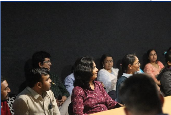
Interaction with Faculties