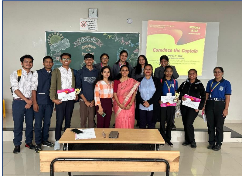
Convince the Captain