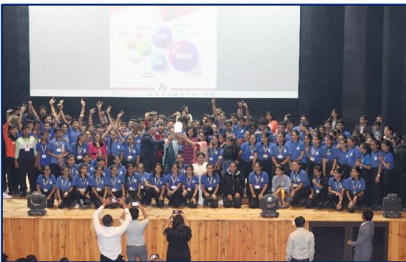
Runners Up team